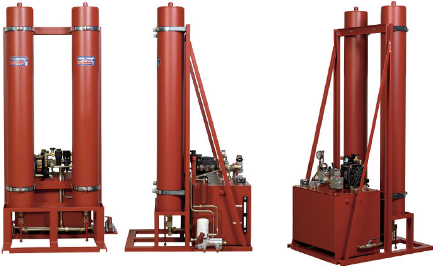
APS starting system (Variation B) with all components mounted on a frame. Two accumulators per system, each with a shut off valve. Complete system ground painted.